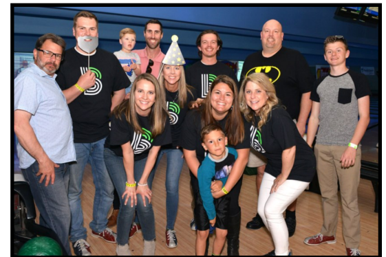
The Hayden Homes team raised over $6,000 for BBBSCO and took home the team grand prize! They are DEFENDERS OF POTENTIAL!

you to our Presenting Sponsor, Cascade Disposal and all of our other generous lane, beer, and pizza sponsors! We could not do what we do without the support of our community, volunteers and local businesses! See you next year