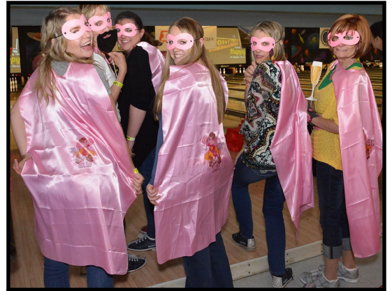
The J Bar J Super Heroes!

A BIG thank you to all who came out to defend potential at the 20th annual Bowl For Kids' Sake! Over $25,000 was raised to match more deserving children with caring adult mentors. A special thank