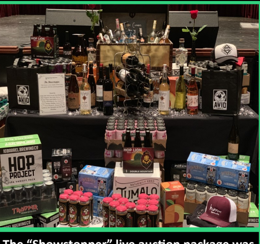
a BIG hit among bidders.

incredible job at setting the tone for an evening of fun and purpose. We want to sincerely thank all of OUT SPONSOTS, CSPC- The "Showstopper" live auction package was cially News Channel