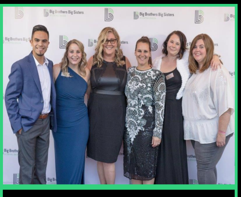
The BBBSCO staff, ready for an amazing night!

The 21st annual Comedy For Kids' Sake, held on October 26th at the Tower Theatre raised $84,000 to help match more deserving youth with Defenders of Potential! Everyone enjoyed the red carpet experience, two hysterical comedians and the jaw dropping auction! Big