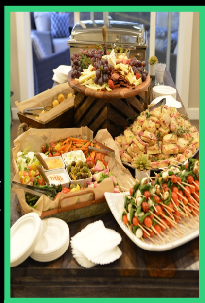
Thank you Bow Tie Catering!

Hayden Homes volunteered the use of their beautiful model home in